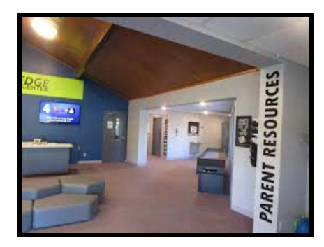
New Youth Center