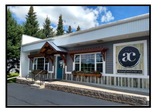
Abiding Care Pregnancy Center (Former Cutting Edge Youth Center)