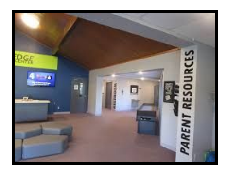
New Youth Center