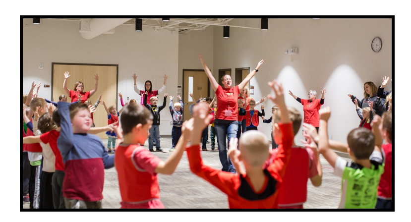
AWANA Sparks Council Time

In addition to children and teen ministries, other ministries include: