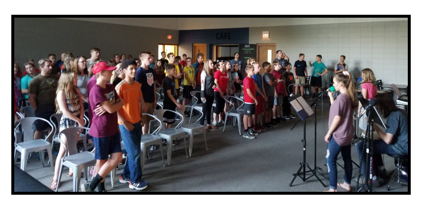
Worship time at youth group