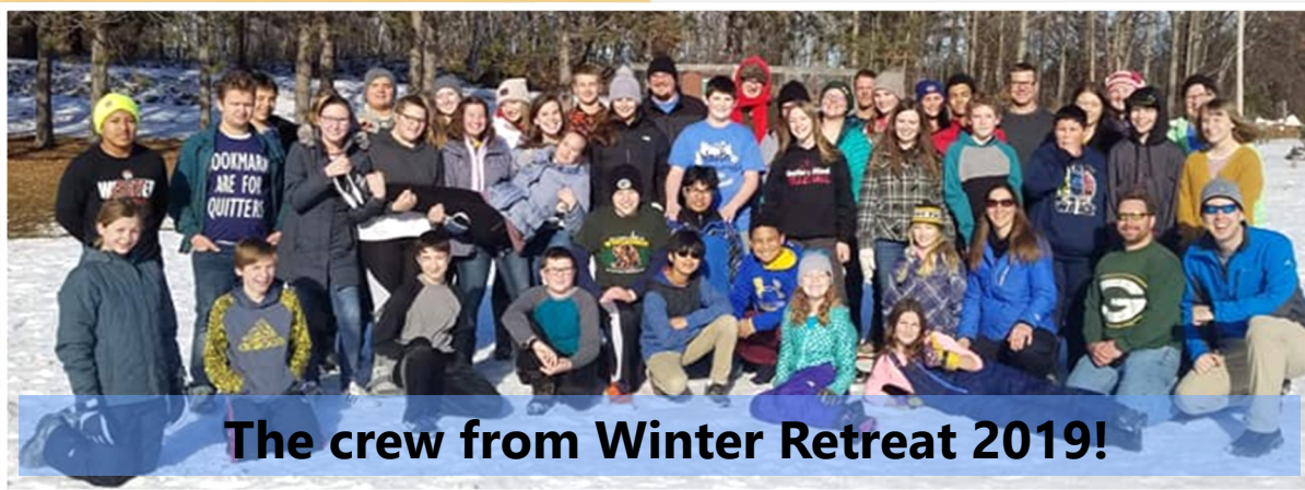
The crew from Winter Retreat 2019!